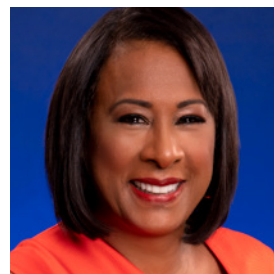
Pat Harvey CBS2/KCAL9