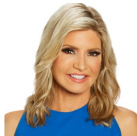
Dayna Devon KTLA5