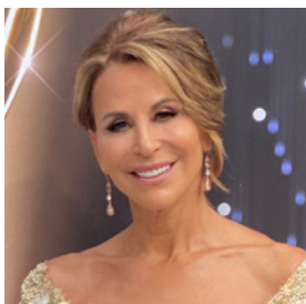
Giselle Fernández Spectrum News 1