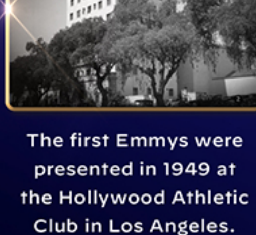
The first Emmys were presented in 1949 at the Hollywood Athletic Club in Los Angeles. Tickets were $5.00.

The statuette is molded and then coated in copper, nickel, silver, and gold; the process takes over five hours.