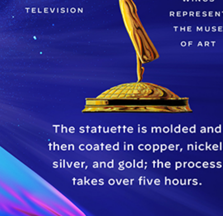
THE ATOM AND ITS ELECTRONS REPRESENT THE SCIENCE AND TECHNOLOGY OF TELEVISION