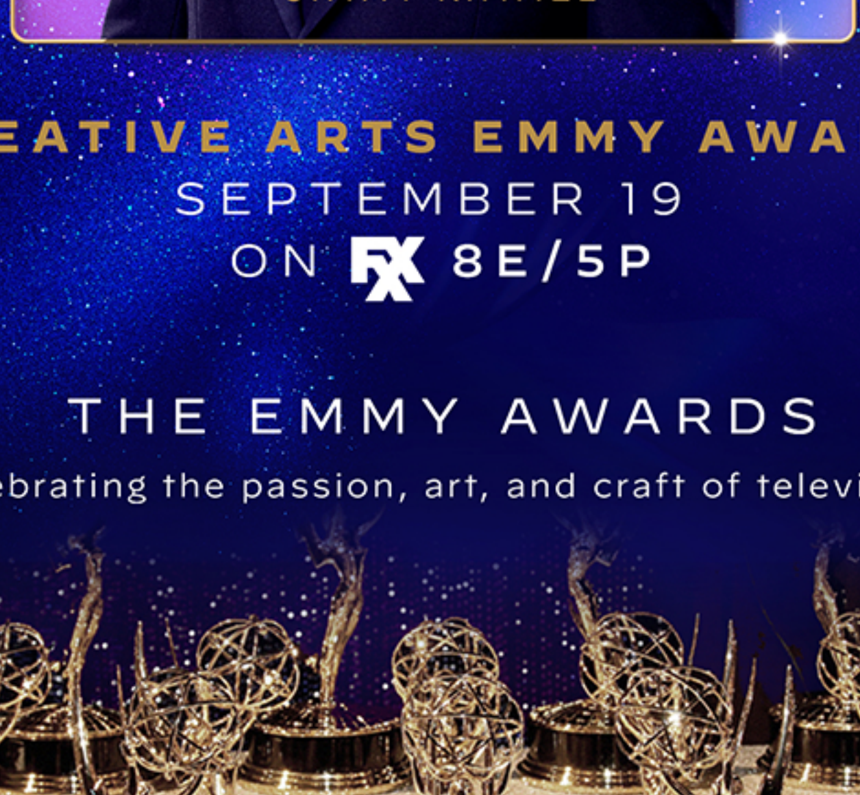
Hosted by JIMMY KIMMEL

CREATIVE ARTS EMMY AWARDS SEPTEMBER 19 ON FX 8E/5P