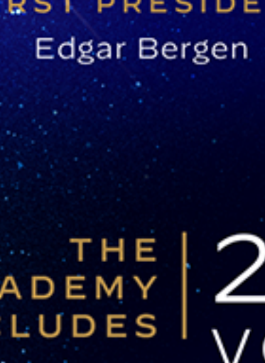
FIRST PRESIDENT Edgar Bergen